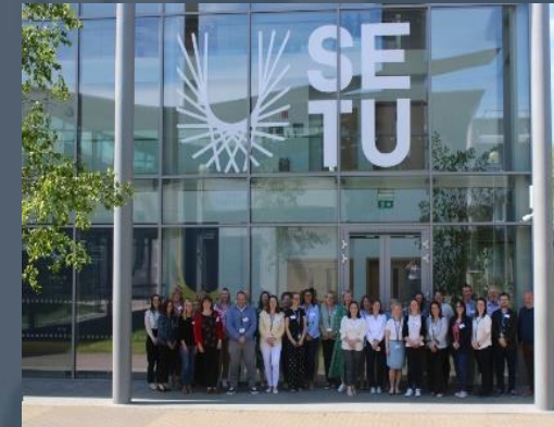
Members of SETU Academic Administration team outside the Haughton Building

We are delighted to advise that all students will receive an SETU branded exam result letter/grade mailer detailing their examination results, and additionally that all CAO 2023 applicants will be choosing their courses from a single SETU CAO course listing.